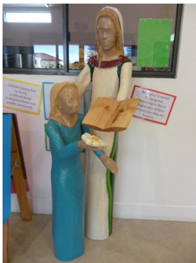
St Anne and Mary

"Learning to live together in harmony, with respect and a vision for positive futures."